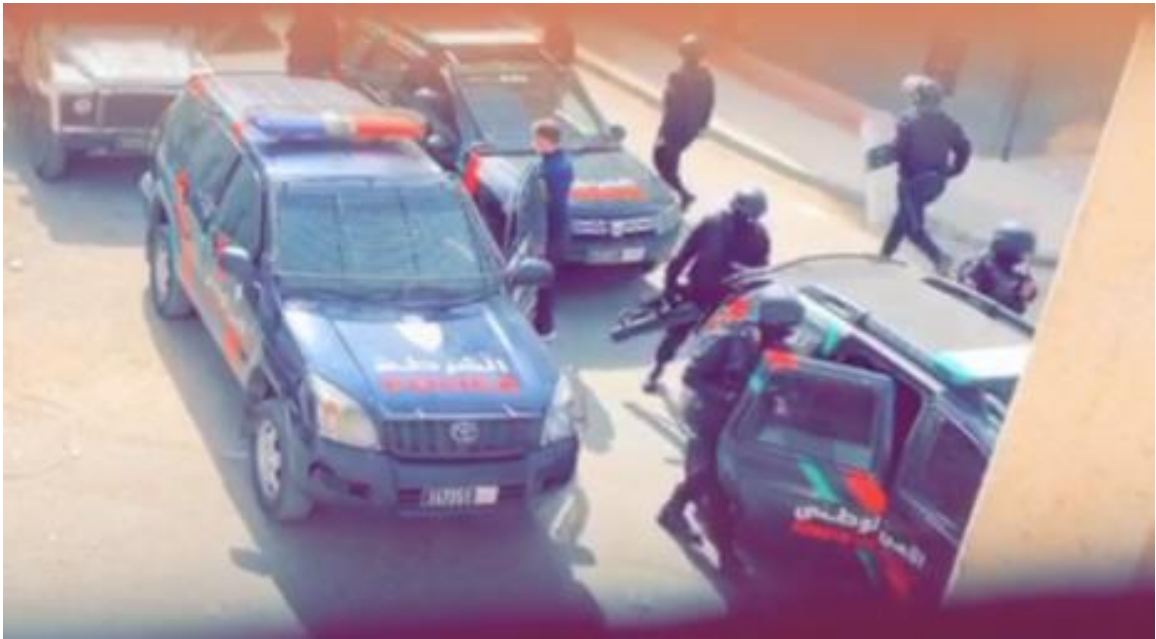
Moroccan police in the city of El Aaiún, occupied Western Sahara, on 15 November 2020